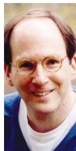
Steve Strogatz: it's time to study more systems.